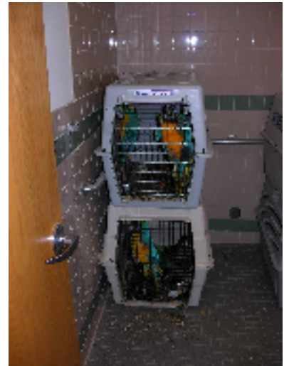
Pueblo Rescue - At the Pueblo Animal Shelter

At the shelter on Friday morning, one by one, each of the birds was given more fresh food, seed, pellets and nuts for the trip. Water was removed from the carriers to minimize mess for the birds, and every bird was carefully loaded up for the next phase of the relocation.