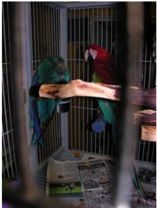
Pueblo Rescue - Green-winged Macaw and Blue and Gold Macaw friend

Thanks to each and every one of you for your outpouring of support.